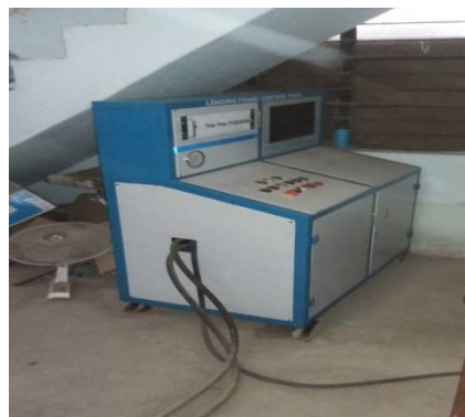
Controller to operate the Loading frame

All the specimens were white washed in order to facilitate marking of cracks. The beam specimen were kept under loading frame with simply supported conditions at both ends. The beam were simply supported on the reaction blocks. A 1000kN servo-controlled hydraulic actuator was used to apply the monotonic loadings. All specimens were tested using two point loading. LVDTs were located at three places, one at mid span and two under load points. LVDTs were also used for each test to monitor shear strain of beams. Electrical strain gauges were used in the test. All the test specimens were tested increment loadings. After applying each increment of load, load, deflection and strain were measured simultaneously. Loading increment is continued in increments up to the failure of the specimen. The behaviour of the beam was observed carefully and the crack widths should be measured using a hand held microscope. All the measurements including deflections, strain values and crack widths should be recorded at regular intervals of load until the beam failed. The parameters such as initial cracking load, ultimate load and the deflected shape of the specimens were noted.