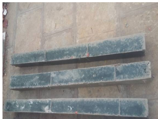
GPC beams After Demoulding