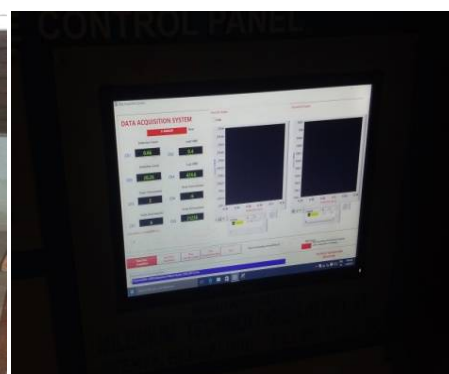
Computer to display and record readings