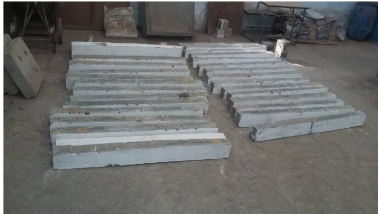
Plate 2. Curing of Geopolymer Concrete Beams