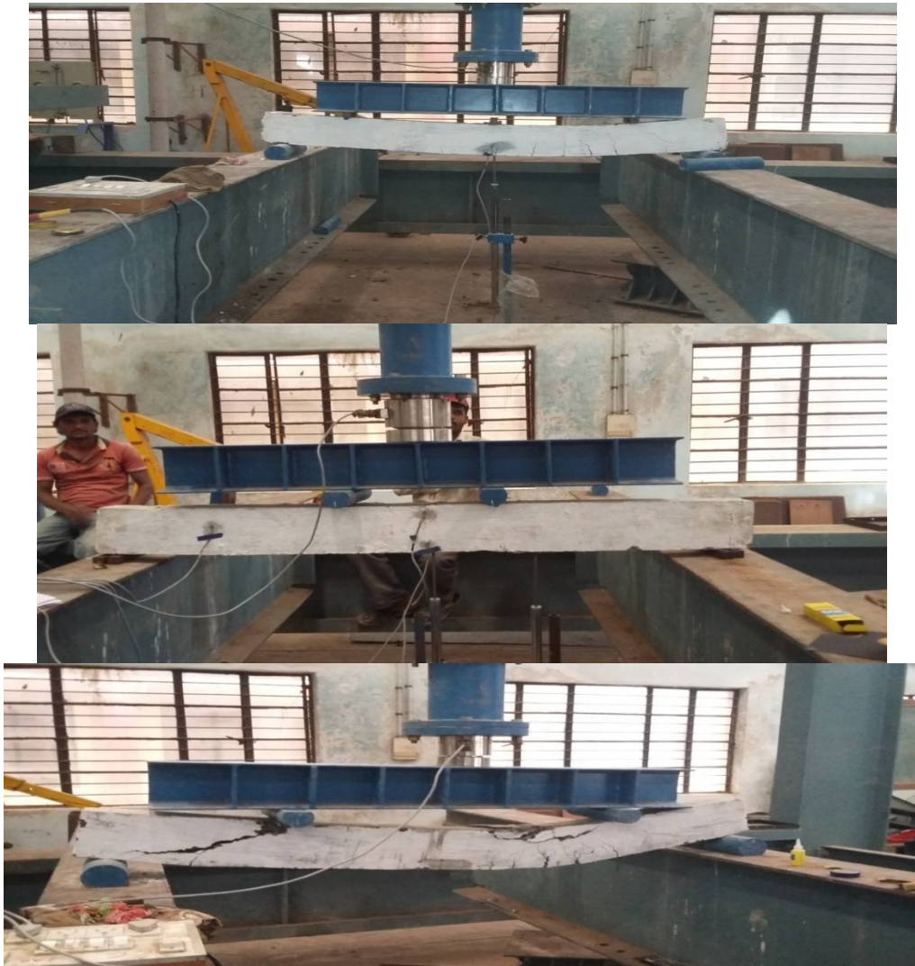
Plate 3. Photos of the testing of the beams under the loading frame