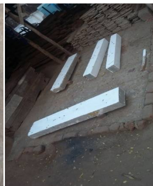
Beams white washed